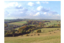
Huthwaite from Crane Moor

Take the path steeply downhill through sheep pasture to the underpass beneath the Upper Don Trail. Continue downhill to follow the riverbank to Cote Lane. Go across and into Old Mill Lane.