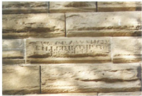
Stone in the Wall of Romticle Viaduct

Cross the field beside the river, then pass behind Cheese Bottom Farm along the wooded bank to join the access road to Thurgoland Bridge.