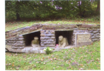
Huskar Pit Memorial in Nabbs Wood

Descend into Partridge Dale, then climb up through Tom Royd Wood to Eastfield.